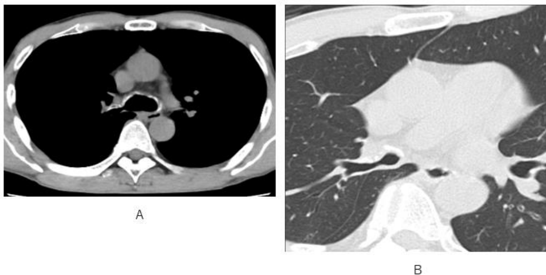
Fig.2 Stenotic right main bronchus with calcified cartilage at anterior bronchus wall is depicted on CT with mediastinal level (A) and pulmonary level (B).